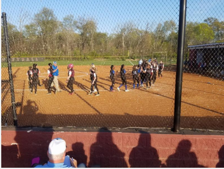
MS softball celebrates a win!

If you have photos of Knights athletes, please email them to mjoseph@Incharter.org .